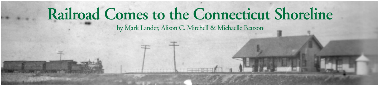
Train crossing Connecticut River bridge to stop at Lyme depot, c. 1890.